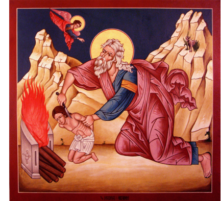
THE SACRIFICE OF ISAAC

Twenty Fifth Annual Conference sponsored by the Orthodox Christian Women of Montreal